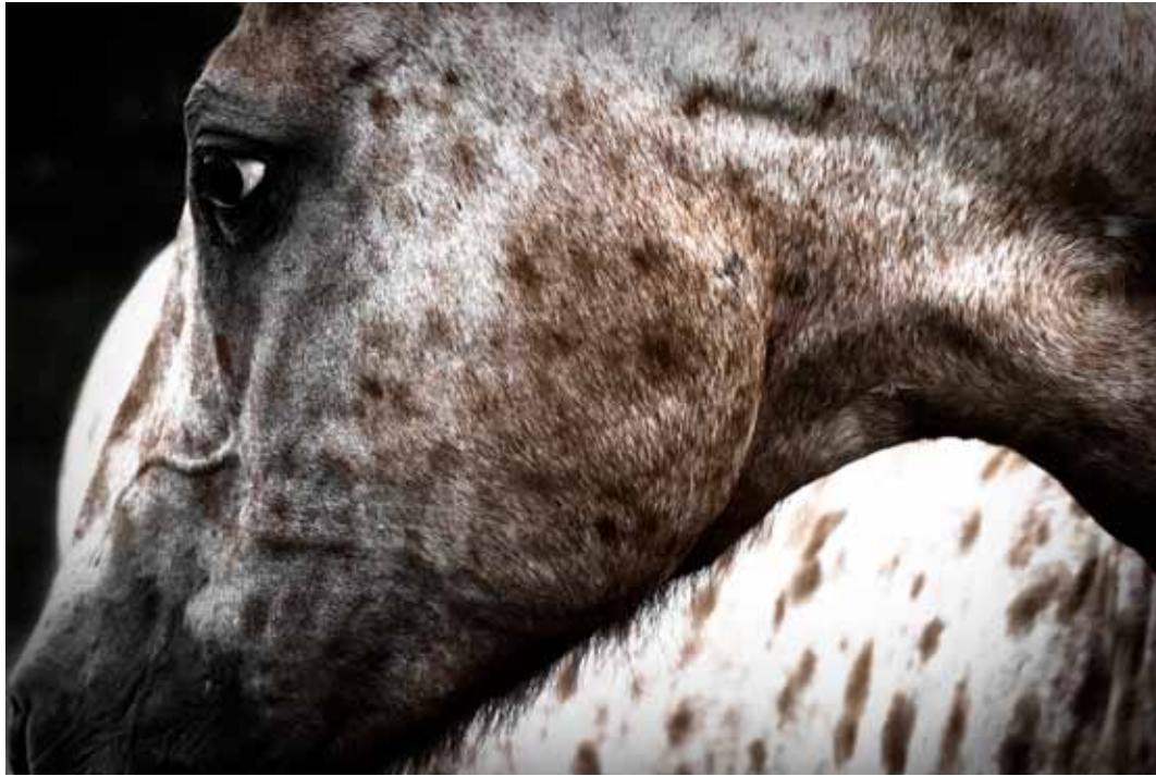
/ Guadalupe Laiz / Horse Gaze