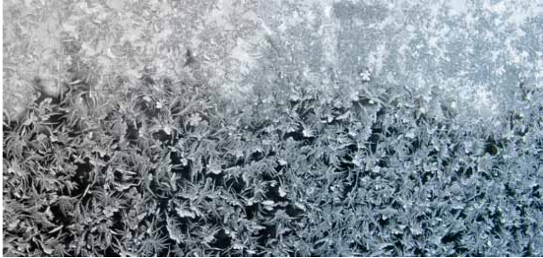
/ Brian Roecker / Ice Garden